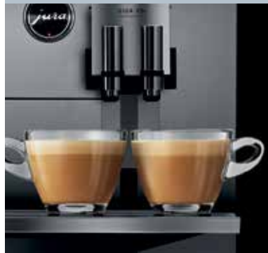
Variable dual spout with 2 coffee spouts and 2 milk spouts